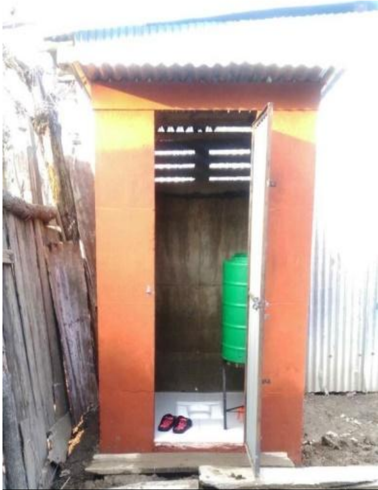
IHH toilet built at Sopore, Kashmir