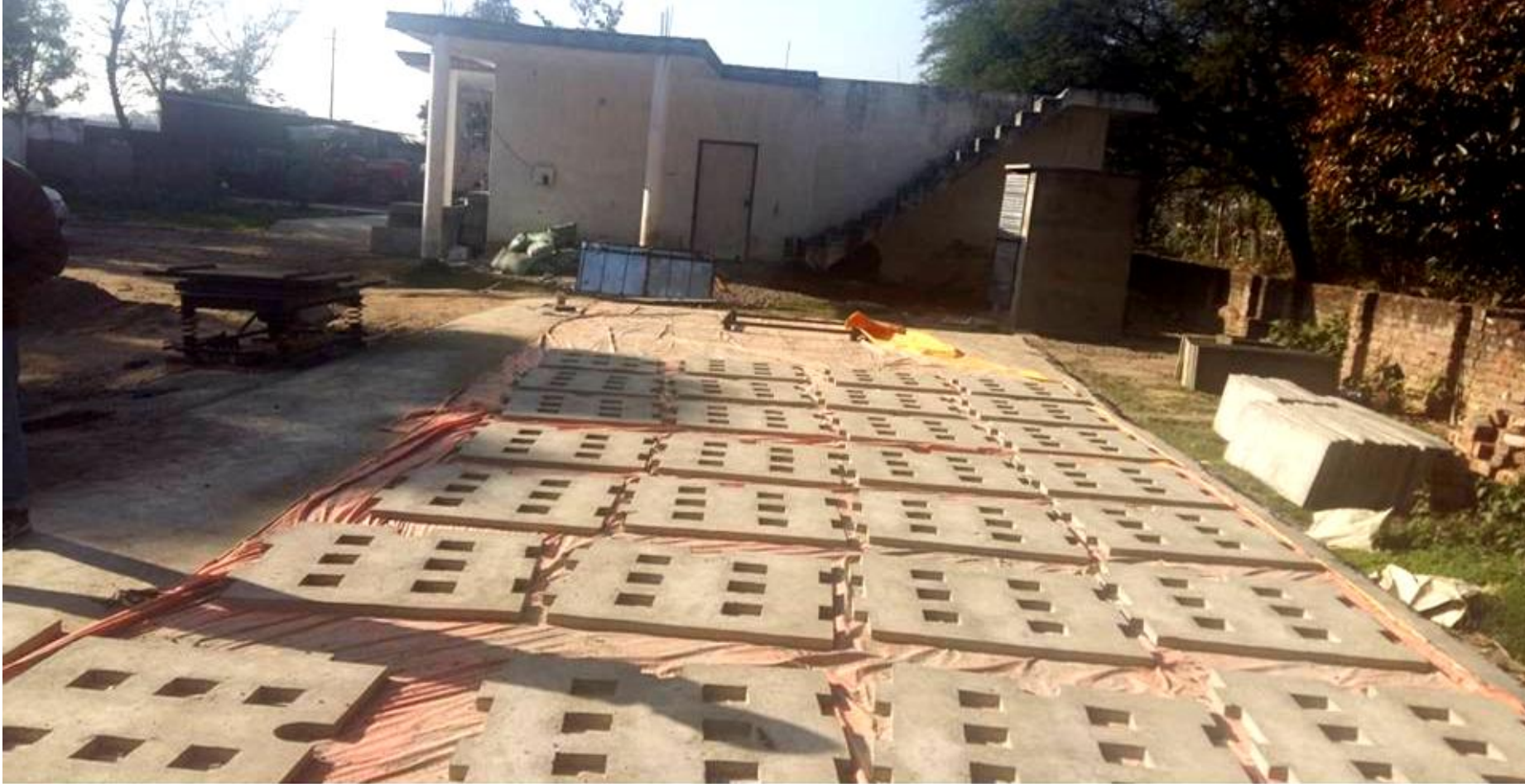
Work station at Marh, Jammu, for speedy and qualitative construction