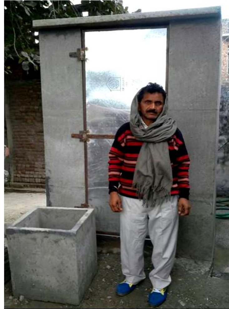
IHH toilet built at Marh, Jammu