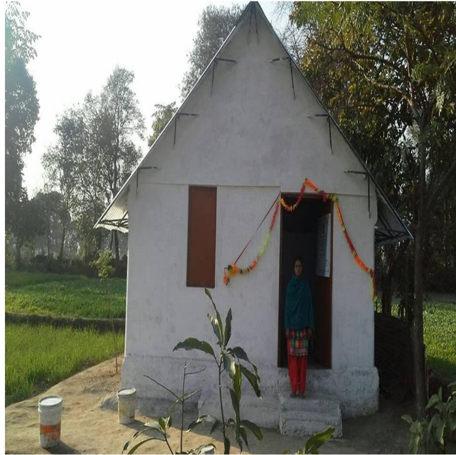
IAY Multi-hazard resilient house K2 at Marh, Jammu