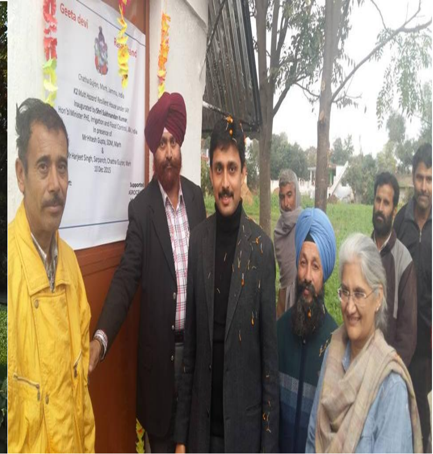
Inauguration of IAY model house, K2 at Marh, Jammu