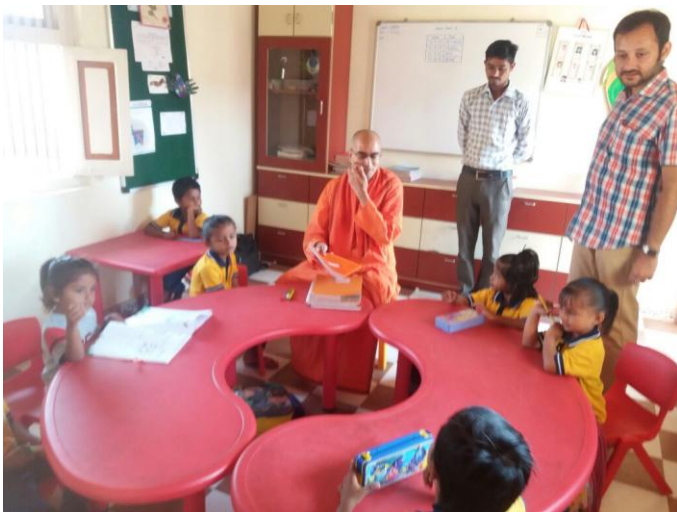
Photo: Mamta School in Bidada

Supporting institutes such as Ramkrishna Seva Mandal Trust.